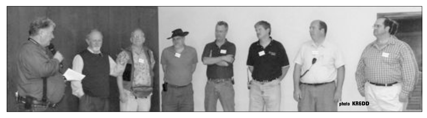
Candidates for December 06 election