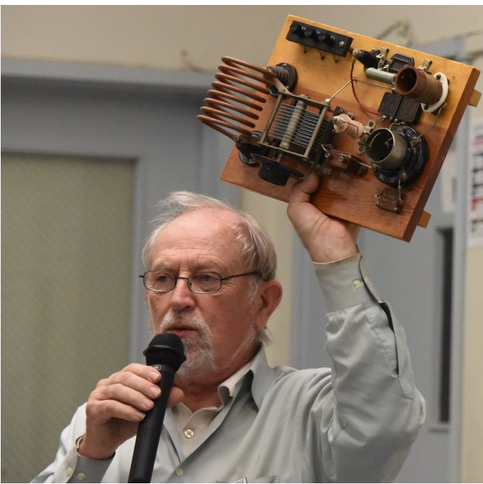
Both young and old enjoyed learning what others brought for Home Brew Night