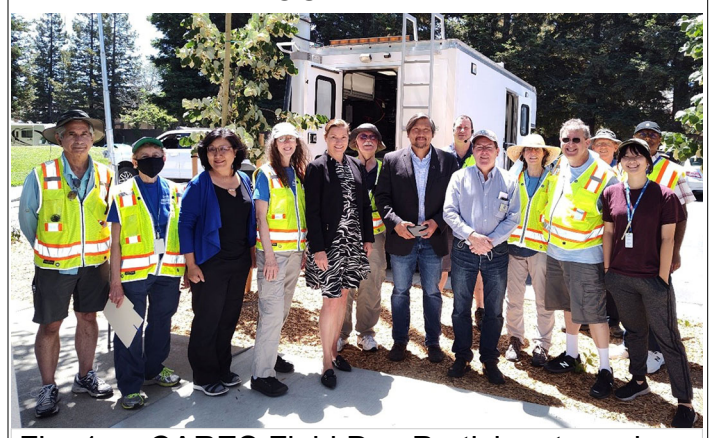
Fig. 1 — CARES Field Day Participants and Dignitaries

CARES operated under the call sign K6KP as 1F SCV. The vehicle behind everyone in the Fig. 1 is ComVan 469 which CARES uses as an extension of the EOC.