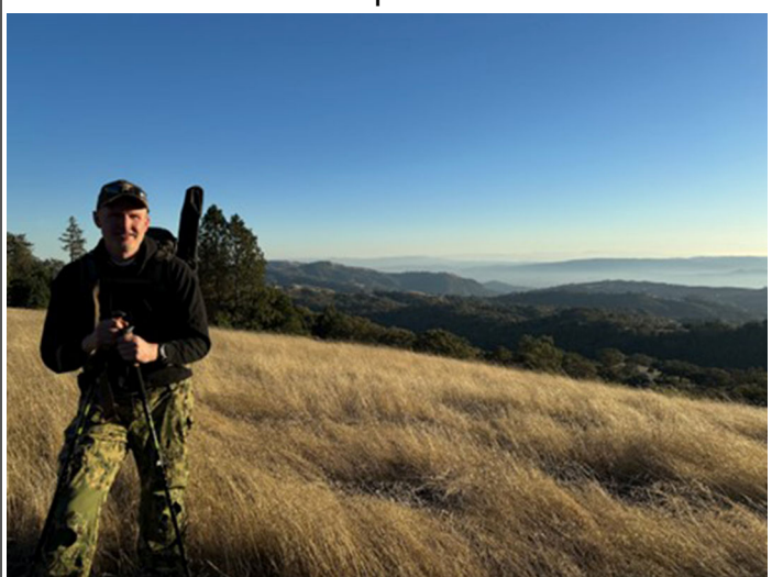
Fig. 3 Shack on my back. What a view when working the airwaves!

Once at the summit, I went on the air and this time the contacts came quickly: 20m was really hopping! However, the sun was starting to get low in the sky so we decided to call it a day and head back to base camp.