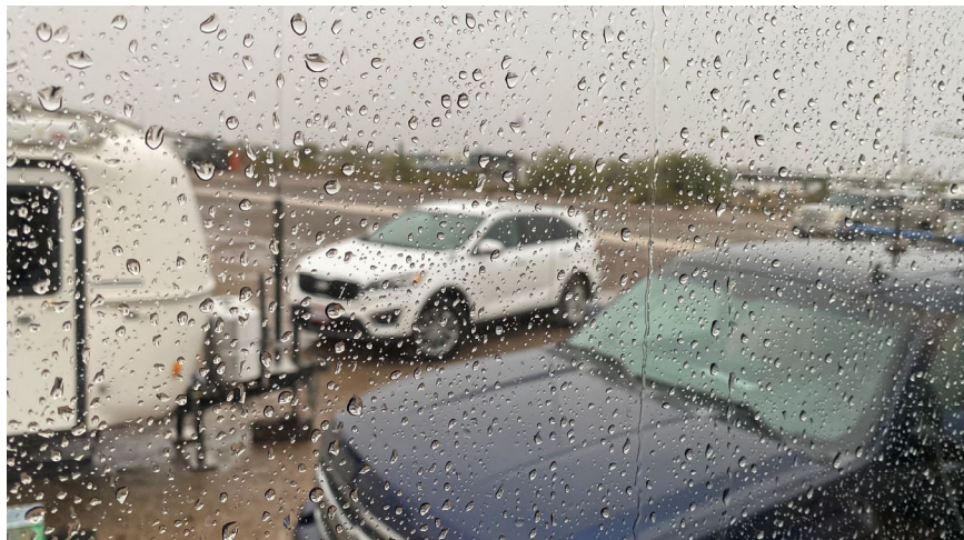
Three views at Quartzfest