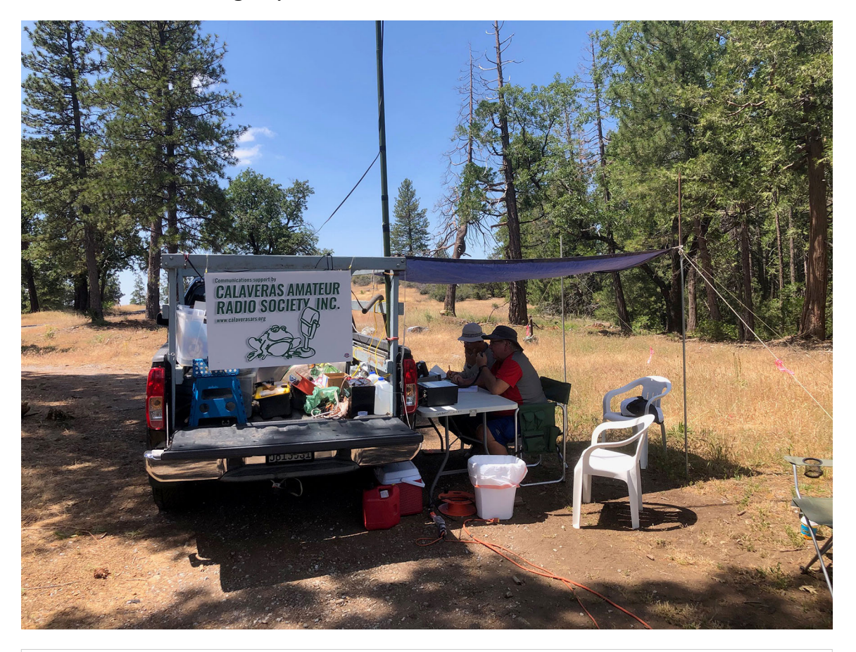
Calaveras Amateur Radio Society Field Day in the Sierra Foothills